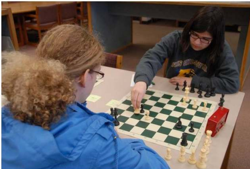
Students in kindergarten through 12th grade competed in the 2012 International Chess Jam, held by Northwest Washington Scholastic Chess in Ferndale. The event is one of several opportunities in Whatcom County for chess players.

Lynden Performing Arts Guild plans for 2016-2017 season